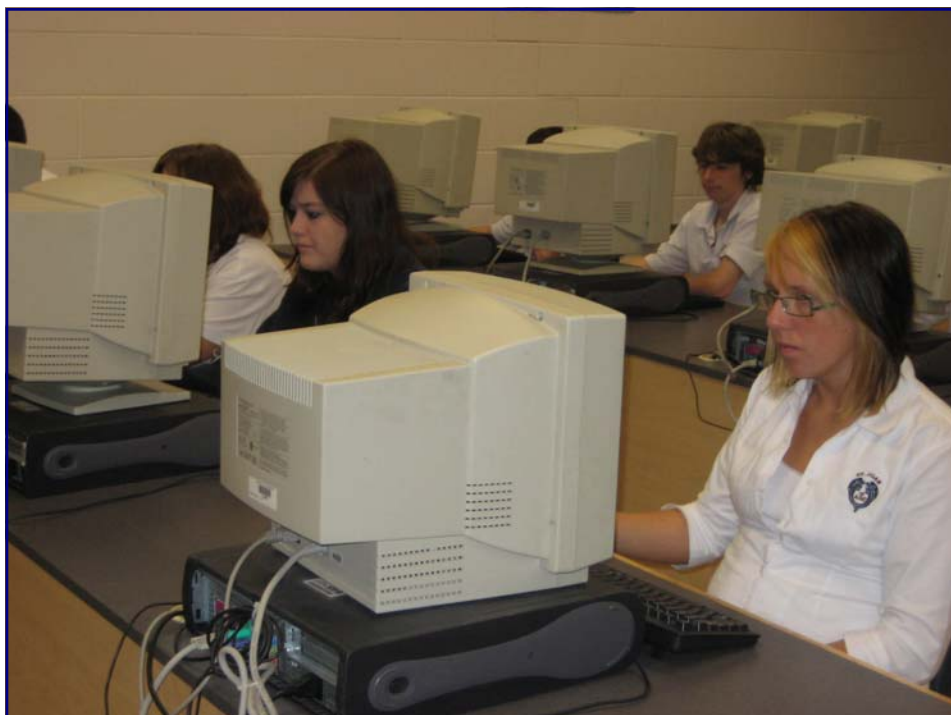
Grade 9 students at St. Joan of Arc participated in an online survey regarding their attitudes and perceptions toward their learning and career aspirations.

It is hoped that fostering student success in the workplace pathway will lead to more rewarding opportunities for all students within the school's community.